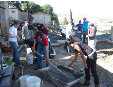
Amor Mission Trip, 2010

Nickels, dimes, etc.?? The yellow coin funnel on the Mission Council table would like to have them. All the money collected will be donated to Cents-Ability, a Presbyterian Church (USA) ministry with programs to fight hunger and poverty.